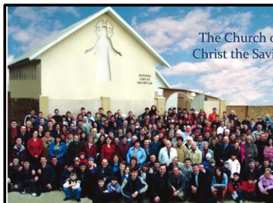
Left: Picture of church first visited in 2007.